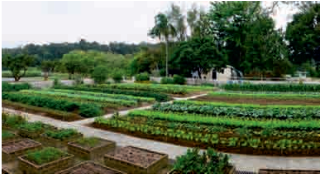
Practicing crop rotation and mix cropping in a modern organic farm