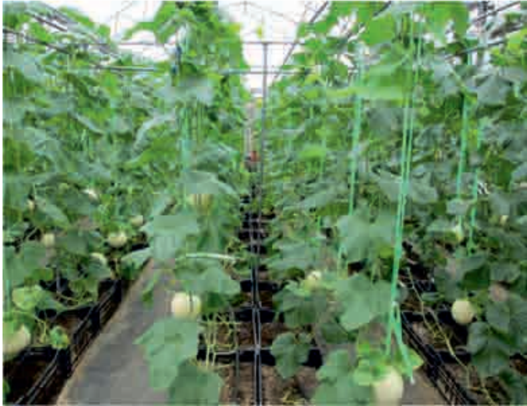
Cultivating high value organic produce in greenhouse