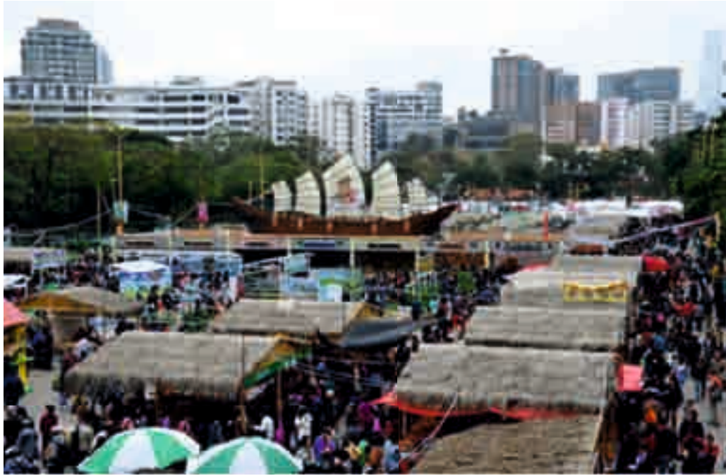
Annual Farmfest to promote local production