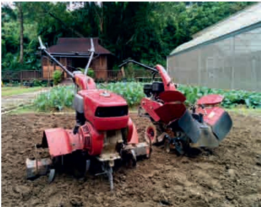
Handheld farming machinery suitable for the typical small family farms in Hong Kong

4.22 We therefore propose to set up an SADF to provide the necessary financial support to facilitate the development of modern, sustainable and urban agriculture in Hong Kong. The SADF will provide funding in the form of grants for scientific as well as adaptive research and studies, such as those on technology development and demonstration. It will also support the transfer of knowledge and training, improvement of agricultural infrastructure, development of local brands and related promotional activities, and exploration of new marketing channels. It will seek to assist individual farmers to modernise their farming equipment and facilities to scale up production and to improve on efficiencies. In addition, it may provide matching grants to entrepreneurs to propel the adoption of new agricultural practices to raise productivity, improve sustainability or diversify local production.