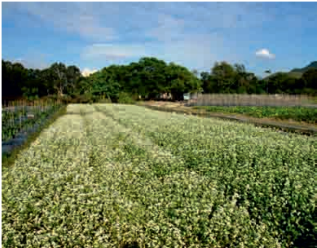
Incorporating the cultivation of Buckwheat as green manure in planting cycles for improving soil in an organic farm