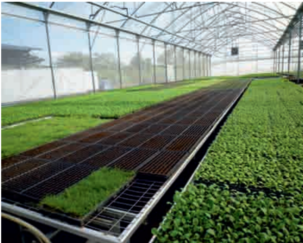
Modern automatic seed sowing and mass production of seedlings to raise production efficiency