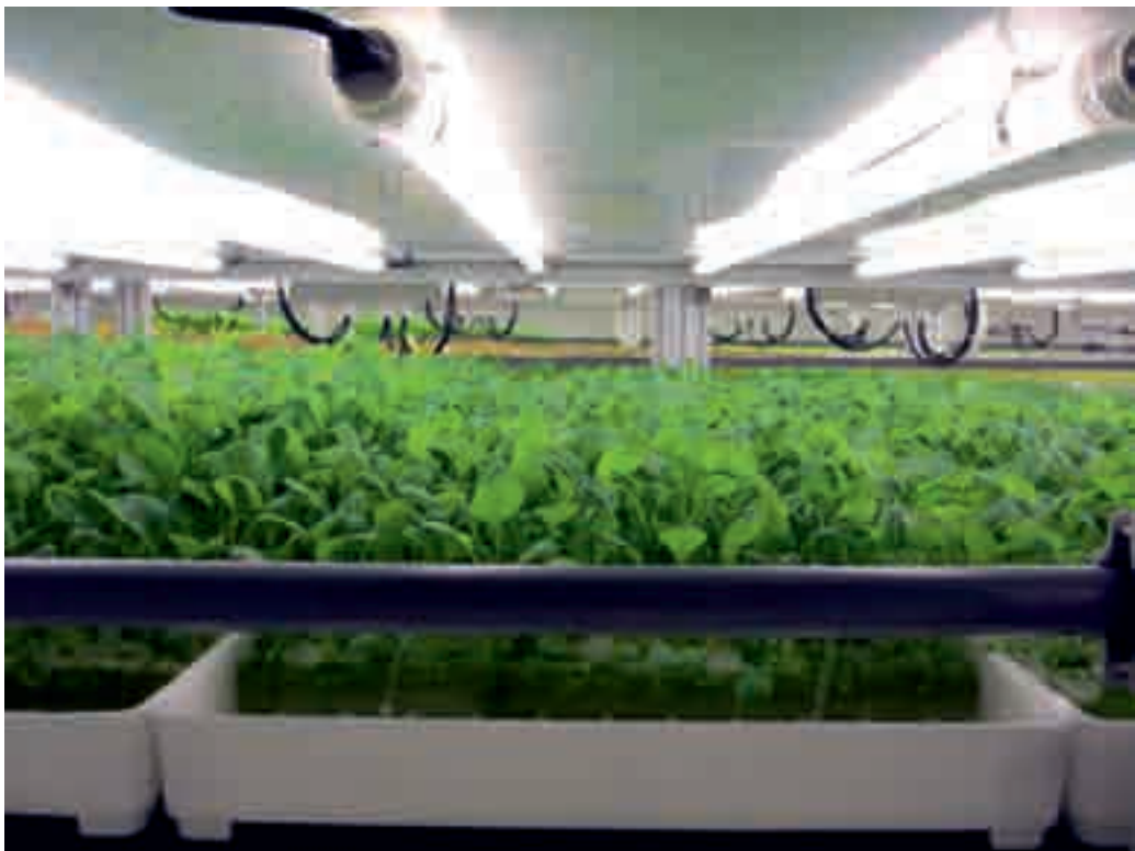
Modern multi-tier hydroponic production in enclosed environment for optimal efficiency and contamination free produce