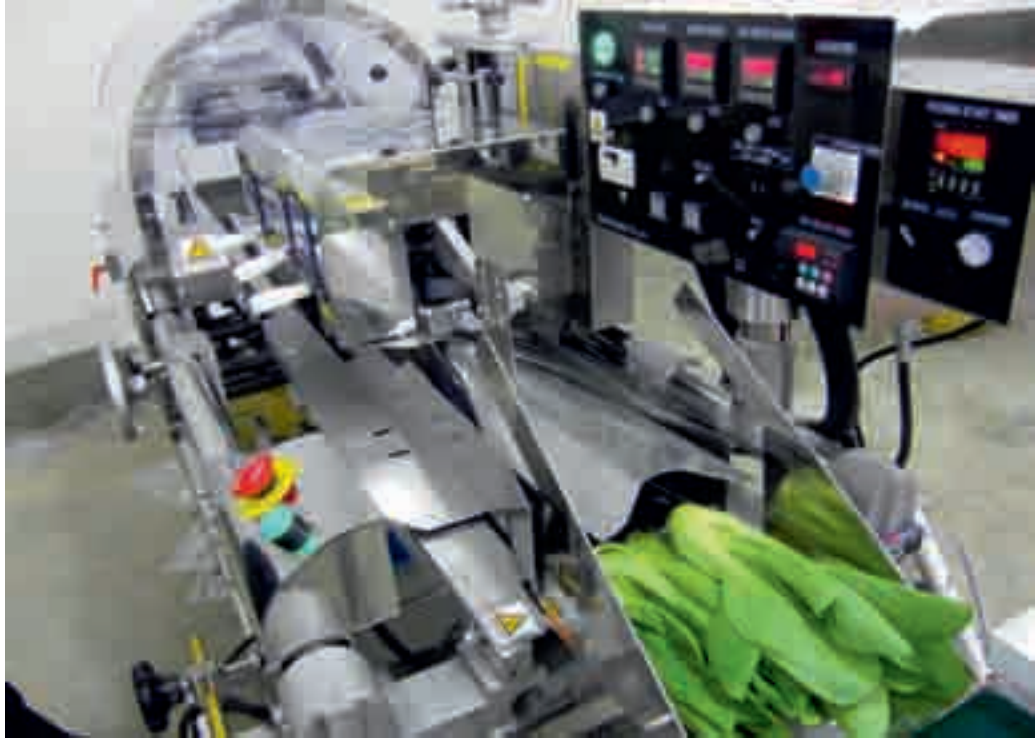
Machine packing vegetables for brand marketing

4.28 Weekend markets and farmers' festivals are other effective ways for farmers to market their products. The annual Farmfests and the various weekend markets currently in operation have been well received by local farmers as well as consumers. Through them, farmers can directly link up with consumers, and save on transaction costs. AFCD will continue to explore the feasibility of setting up more weekend markets in more districts.