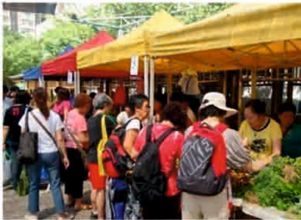
Weekly farmers market at Tai Po

4.29 In supporting the further development of local agriculture, AFCD will strengthen liaison with the various stakeholders involved, i.e. academics and researchers, industry associations and representatives, agricultural entrepreneurs and mainstream farmers, as well as