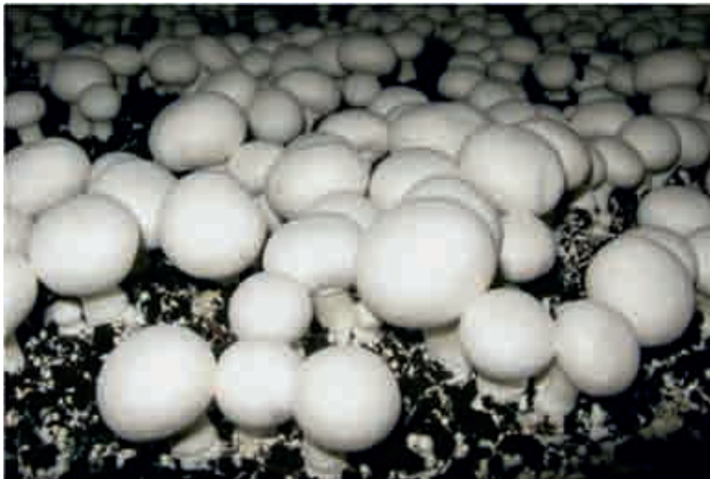
Modern mushroom cultivation under controlled temperature, humidity and light intensity