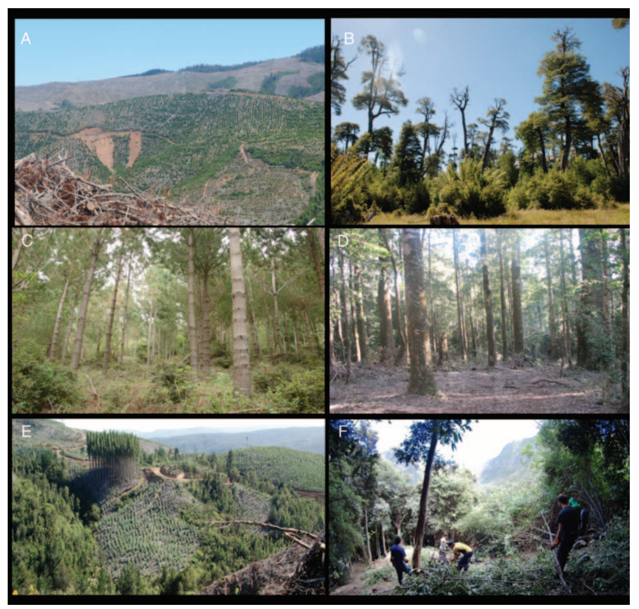
Figure 3. View of a typical clearcut in the landscape (A) and a high graded native forest in the Andes of southcentral Chile (B), a managed plantation of radiata pine (C), a stand of evergreen forest type under uneven-aged management (D), a plantation of well-managed Eucalyptus nitens in the Chilean Coastal Range, stream buffers with protection of native vegetation (E), and invasive species management for restoration to conserve the endemic forest of Robinson Crusoe Island (F).

(Cubbage et al. 2007, Nahuelhual et al. 2007). The Chilean government, during 2008, approved a forestry law that would give some economic support to landowners willing to manage their natural stands under a sustainable framework, but its application has been negligible because of the small amount of the subsidies.